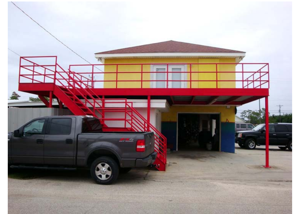
3 EXISTING WEST FACADE A103 NTS