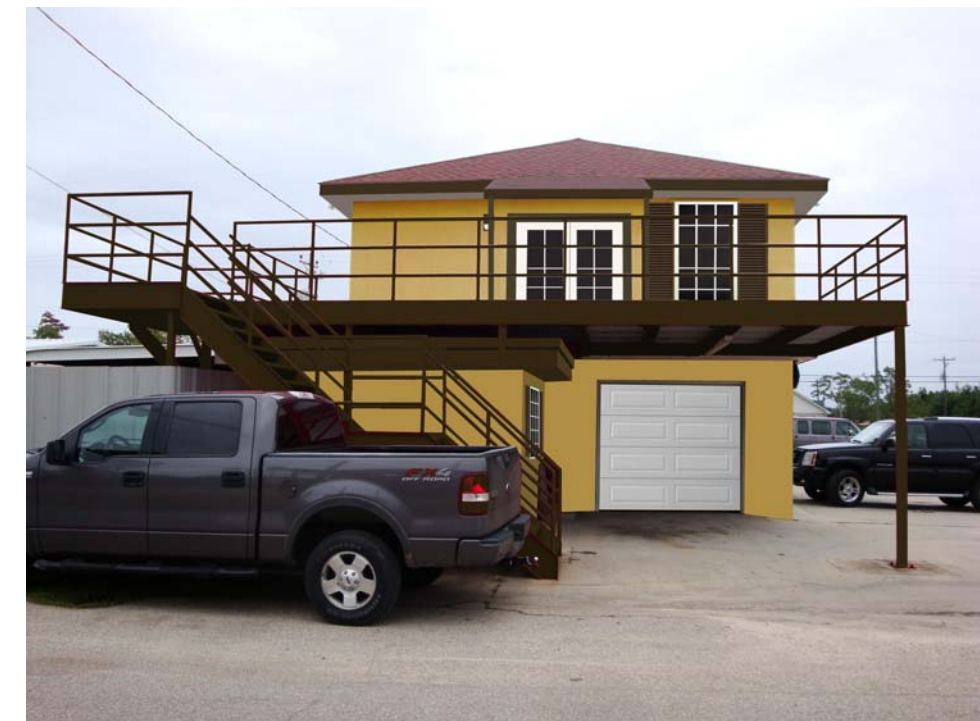
4 RENOVATED WEST FACADE A103 NTS

PROJECT NAME: D'IBERVILLE FACADE GRANT PROGRAM- BID PACKAGE #2