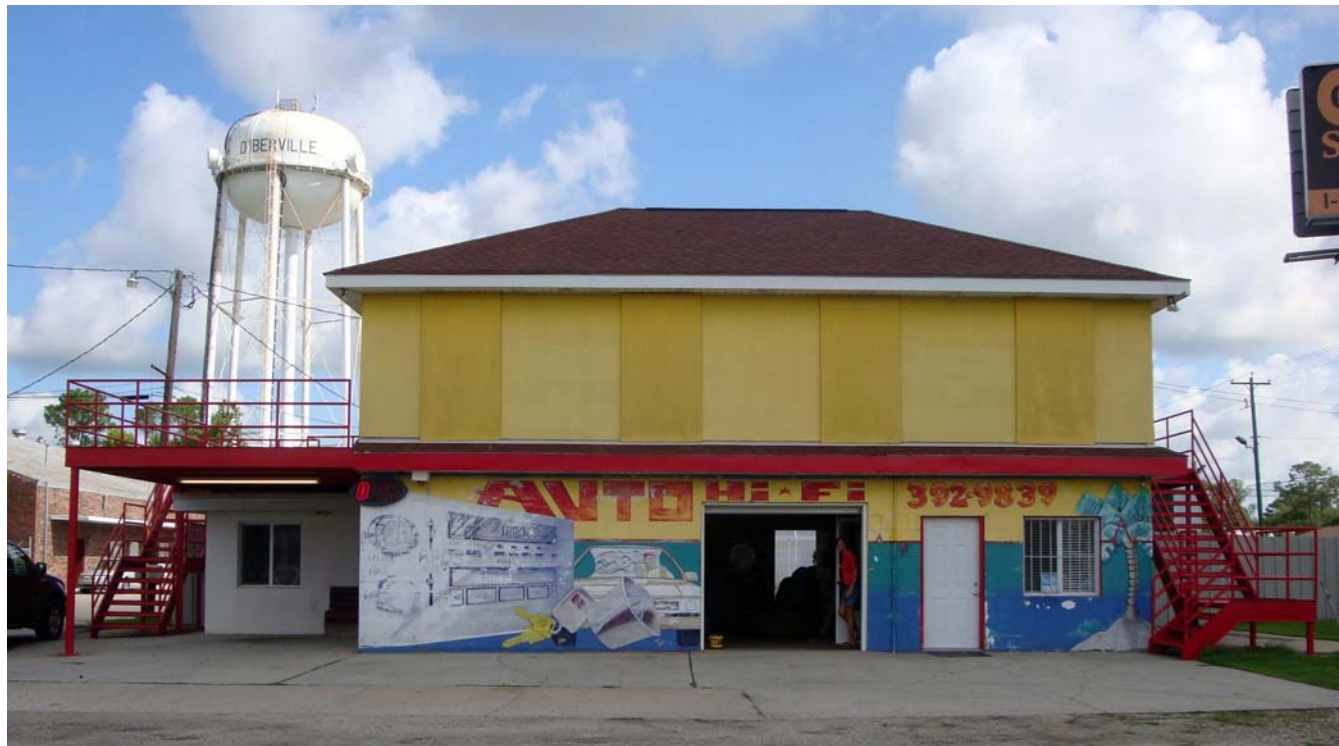
1 EXISTING SOUTH FACADE A102 NTS