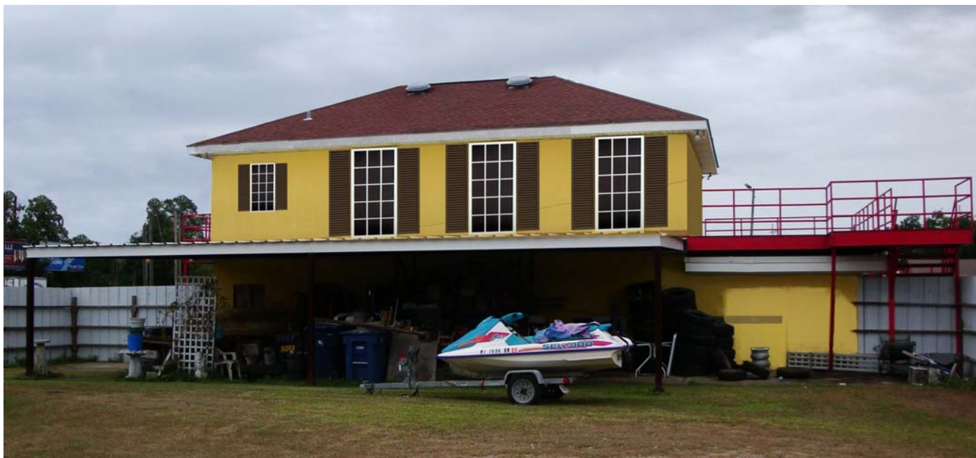
2 RENOVATED NORTH FACADE A103 NTS