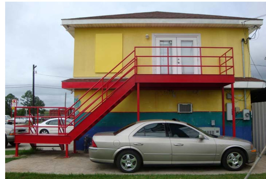
3 EXISTING EAST FACADE A102 NTS

GENERAL NOTES: 1) FIELD VERIFY ALL EXISTING CONDITIONS. 2) FIELD VERIFY ALL DIMENSIONS AND COORDINATE AS REQUIRED. 3) SEE SPECIFICATIONS FOR SELECTIVE DEMOLITION NOTES. 4) PRODUCT DATA SHEETS MAY BE INCLUDED TO ILLUSTRATE DESIGN INTENT AND ARE FOR REFERENCE ONLY. SUBSTITUTION REQUESTS ARE ALLOWABLE AS "EQUAL AS APPROVED" PRODUCTS. 5) CONTRACTOR TO FIELD-VERIFY EXISTING CONDITIONS PRIOR TO INSTALLATION OF FASTENING DEVICES.