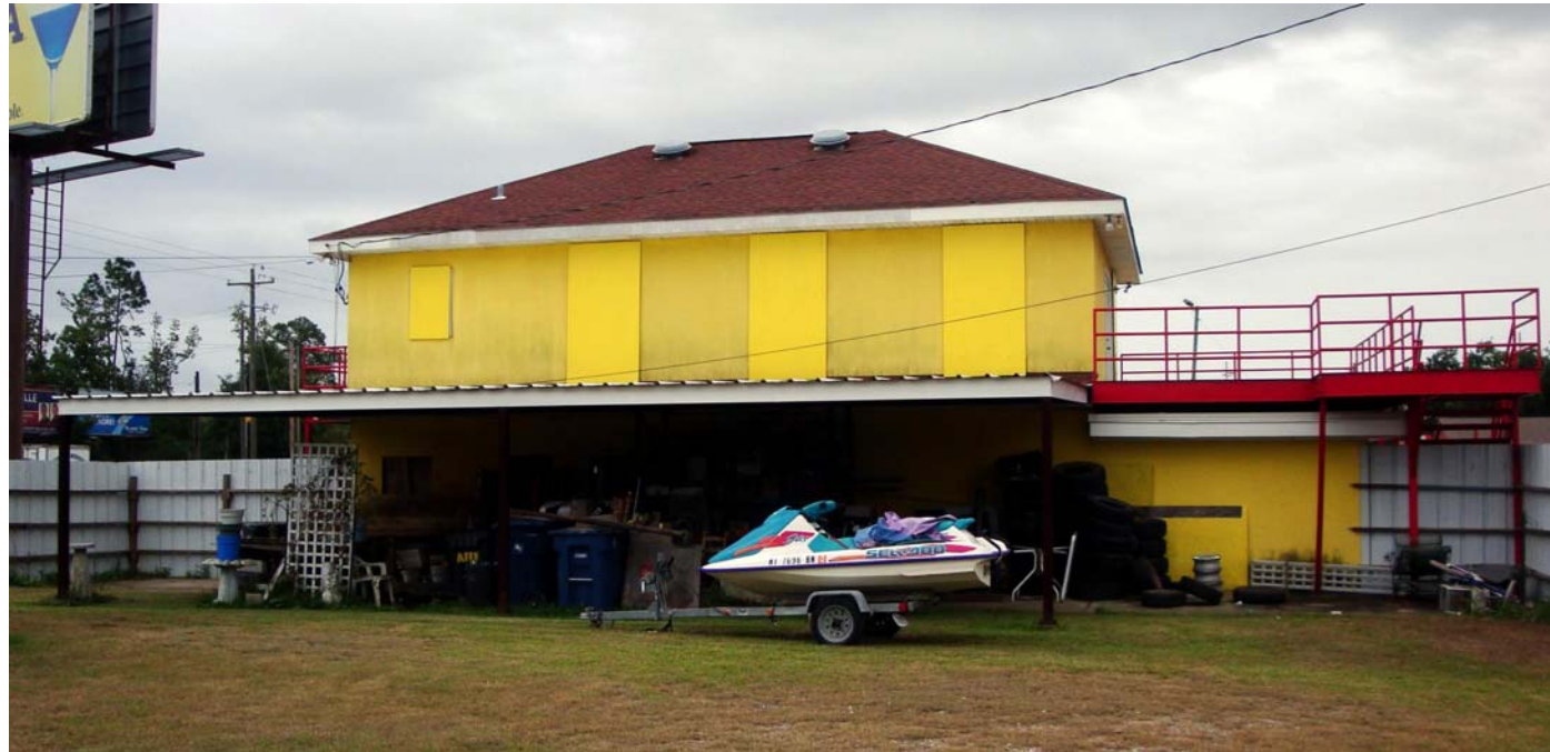
1 EXISTING NORTH FACADE A103 NTS