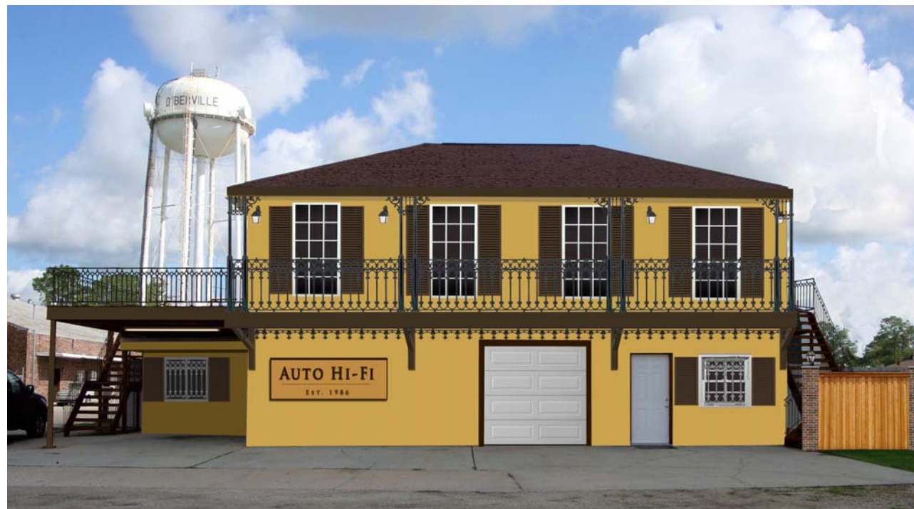
2 RENOVATED SOUTH FACADE A102 NTS

GENERAL NOTES: 1) FIELD VERIFY ALL EXISTING CONDITIONS. 2) FIELD VERIFY ALL DIMENSIONS AND COORDINATE AS REQUIRED. 3) SEE SPECIFICATIONS FOR SELECTIVE DEMOLITION NOTES. 4) PRODUCT DATA SHEETS MAY BE INCLUDED TO ILLUSTRATE DESIGN INTENT AND ARE FOR REFERENCE ONLY. SUBSTITUTION REQUESTS ARE ALLOWABLE AS "EQUAL AS APPROVED" PRODUCTS. 5) CONTRACTOR TO FIELD-VERIFY EXISTING CONDITIONS PRIOR TO INSTALLATION OF FASTENING DEVICES.