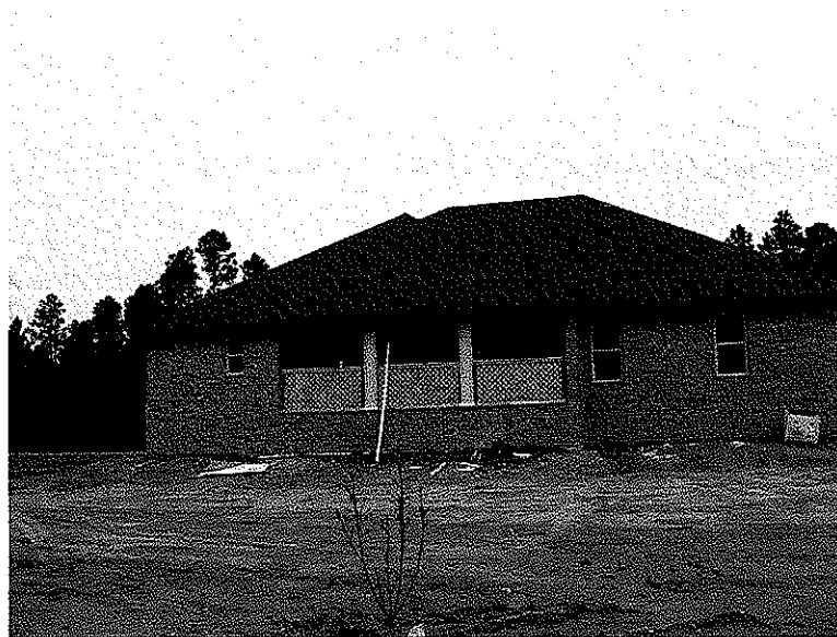
25 FEBRUARY 2014--REAR VIEW