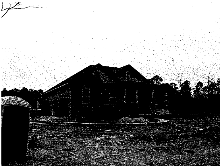
25 FEBRUARY 2014--FRONT VIEW

If using the Elevation Certificate to obtain NFIP flood insurance, affix at least 2 building photographs below according to the instructions for Item A6. Identify all photographs with date taken; "Front View" and "Rear View"; and, if required, "Right Side View" and "Left Side View." When applicable, photographs must show the foundation with representative examples of the flood openings or vents, as indicated in Section A8. If submitting more photographs than will fit on this page, use the Continuation Page.