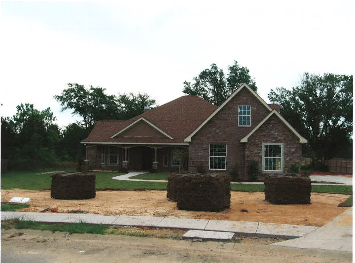
FRONT VIEW – 17 APRIL 2012