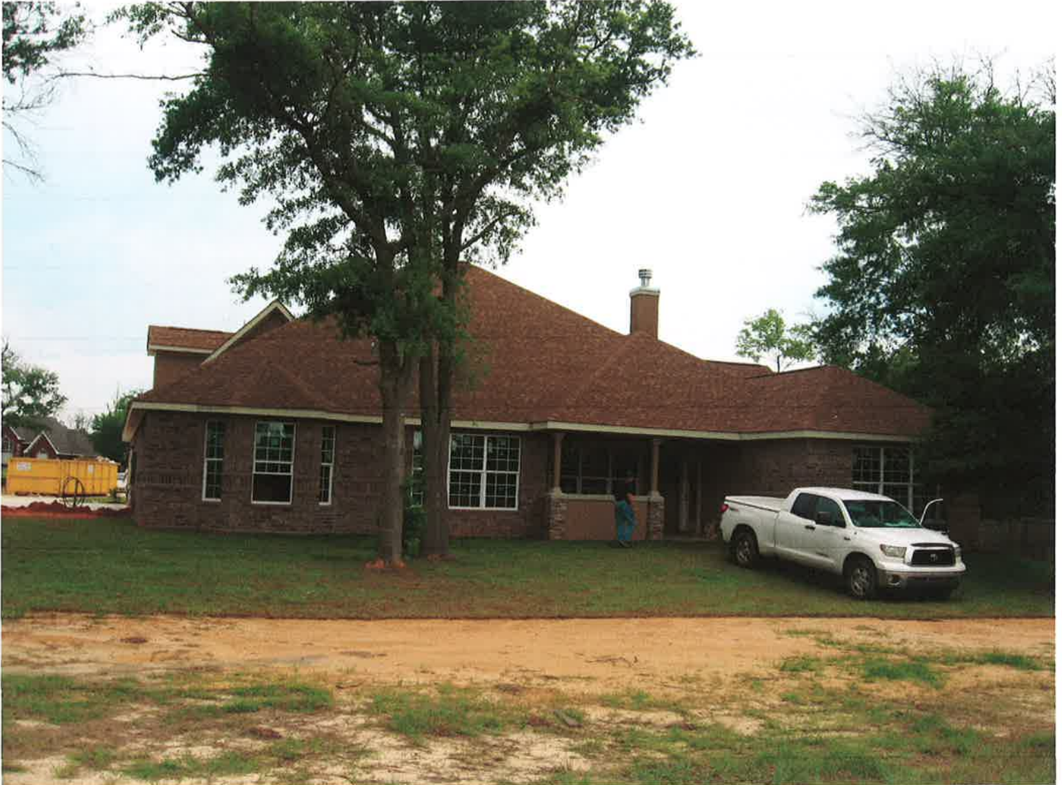
REAR VIEW – 17 APRIL 2012