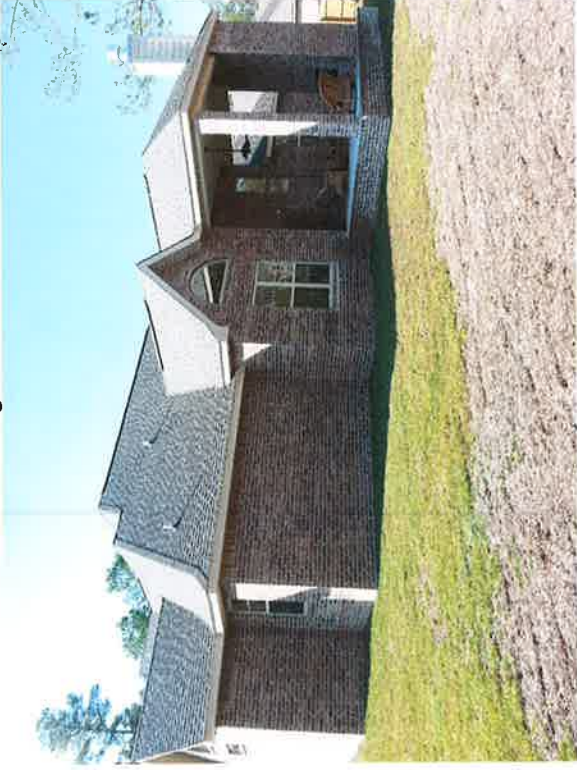
Northeast of the house looking Southwesterly at the Northern edge.