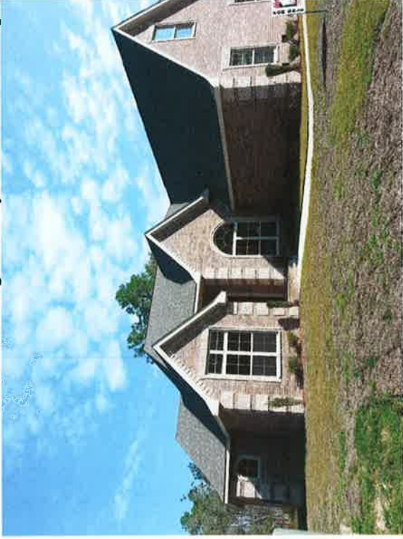
Southwest of the house looking Northerly at the South building face.