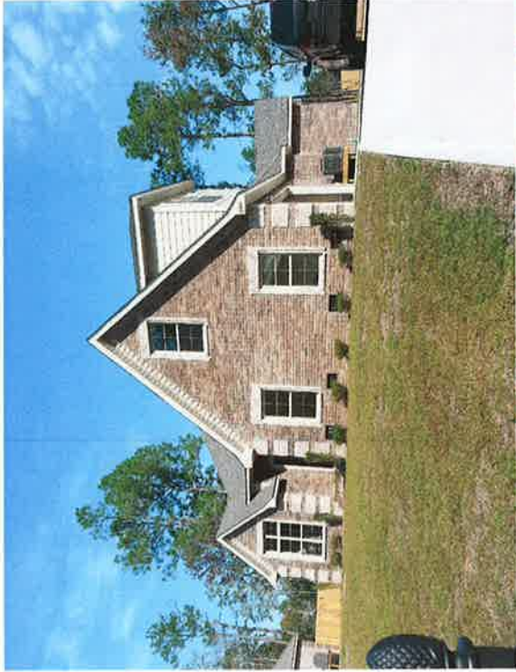
Southeast of the house looking Northerly at the South building face.