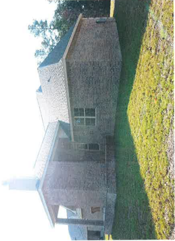
Northwest of the house looking Southeast at the Northern edge.