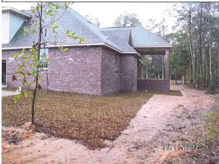
Rear right side looking West along the North edge of the house.

If using the Elevation Certificate to obtain NFIP flood insurance, affix at least two building photographs below according to the instructions for Item A6. Identify all photographs with: date taken; "Front View" and "Rear View"; and, if required, "Right Side View" and "Left Side View." If submitting more photographs than will fit on this page, use the Continuation Page, following.