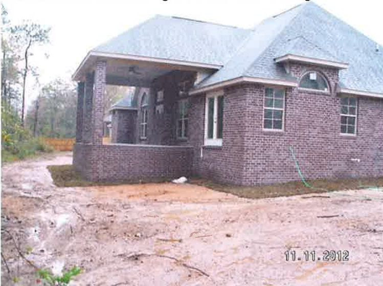
Northeast of the house looking at the West and North edges.