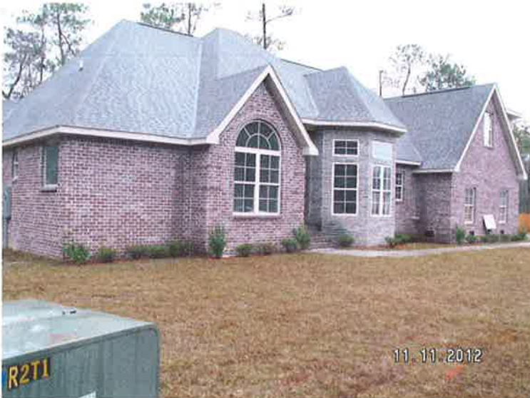
Southwest of the house looking at the South and West edges.