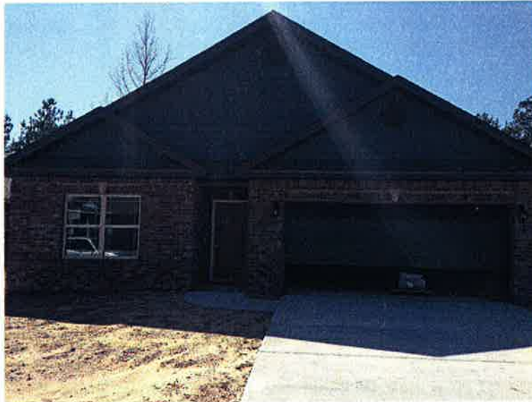
FRONT VIEW OF BUILDING. PICTURE TAKEN 03/15/2016.

If using the Elevation Certificate to obtain NFIP flood insurance, affix at least 2 building photographs below according to the instructions for Item A6. Identify all photographs with date taken; "Front View" and "Rear View"; and, if required, "Right Side View" and "Left Side View." When applicable, photographs must show the foundation with representative examples of the flood openings or vents, as indicated in Section A8. If submitting more photographs than will fit on this page, use the Continuation Page.