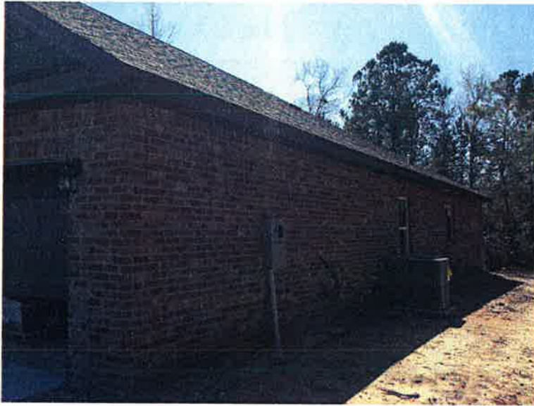
RIGHT SIDE VIEW OF BUILDING. PICTURE TAKEN 03/15/2016

If submitting more photographs than will fit on the preceding page, affix the additional photographs below. Identify all photographs with: date taken; "Front View" and "Rear View"; and, if required, "Right Side View" and "Left Side View." When applicable, photographs must show the foundation with representative examples of the flood openings or vents, as indicated in Section A8.