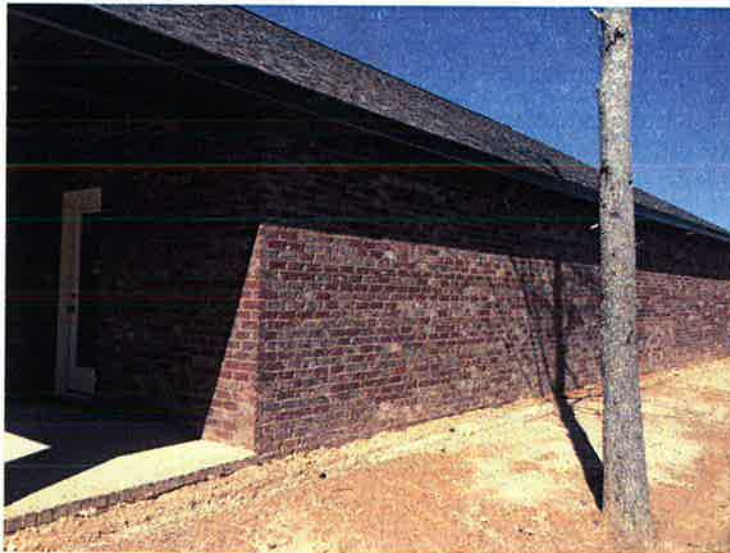
LEFT SIDE VIEW OF BUILDING. PICTURE TAKEN 03/15/2016.