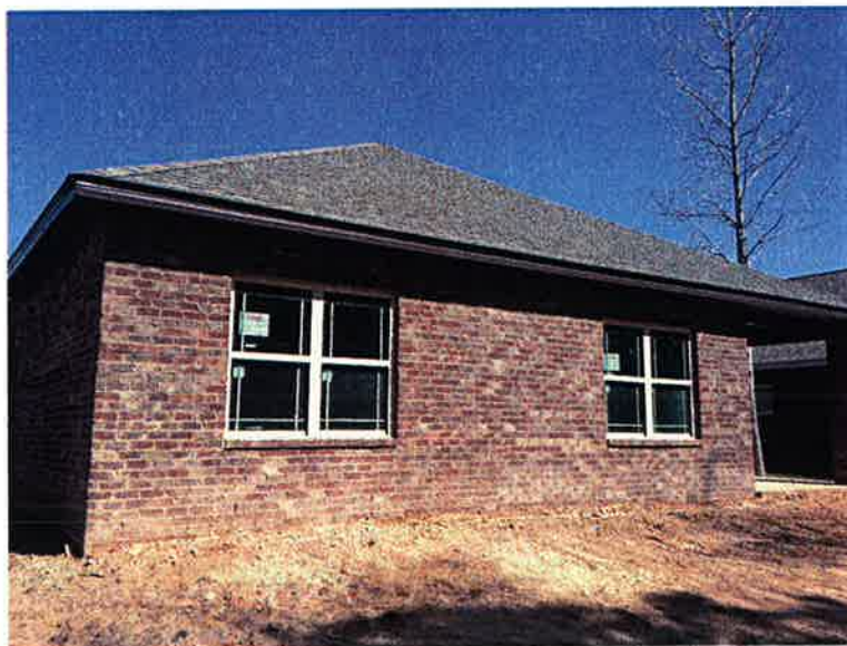
REAR VIEW OF BUILDING. PICTURE TAKEN 03/15/2016.