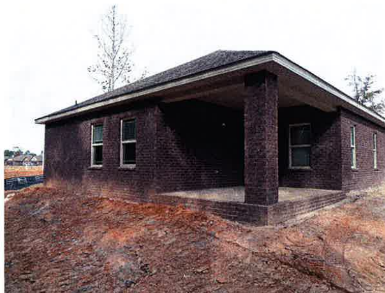
REAR VIEW OF BUILDING. PICTURE TAKEN 12/01/2015