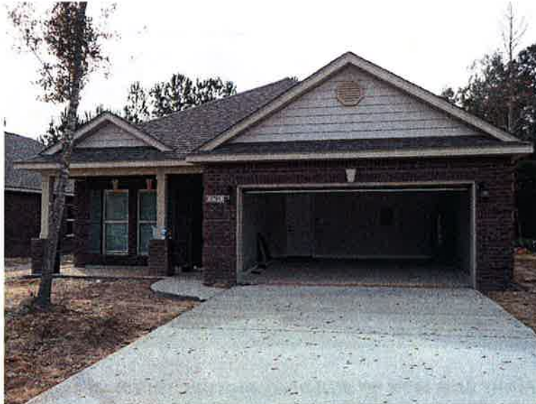
FRONT VIEW OF BUILDING. PICTURE TAKEN 12/01/2015

If using the Elevation Certificate to obtain NFIP flood insurance, affix at least 2 building photographs below according to the instructions for Item A6. Identify all photographs with date taken; "Front View" and "Rear View"; and, if required, "Right Side View" and "Left Side View." When applicable, photographs must show the foundation with representative examples of the flood openings or vents, as indicated in Section A8. If submitting more photographs than will fit on this page, use the Continuation Page.