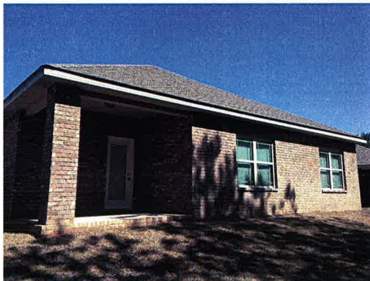
REAR VIEW OF RESIDENCE. PICTURE TAKEN 3/15/2016