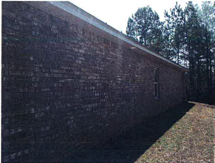
RIGHT SIDE VIEW OF BUILDING. PICTURE TAKEN 03/15/2016

If submitting more photographs than will fit on the preceding page, affix the additional photographs below. Identify all photographs with: date taken; "Front View" and "Rear View"; and, if required, "Right Side View" and "Left Side View." When applicable, photographs must show the foundation with representative examples of the flood openings or vents, as indicated in Section A8.