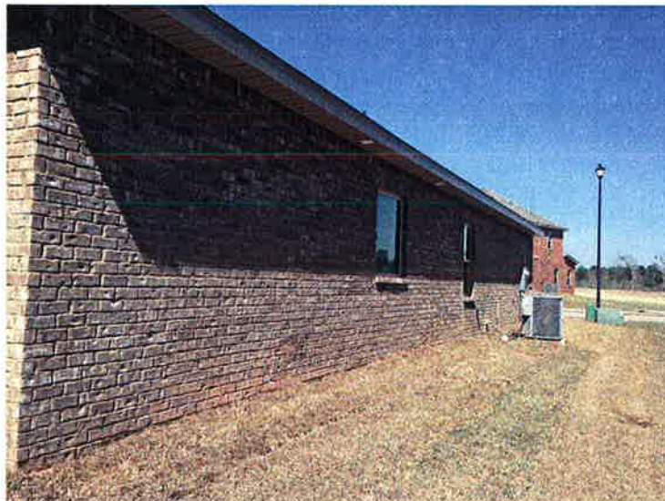
LEFT SIDE VIEW OF BUILDING. PICTURE TAKEN 03/15/2016