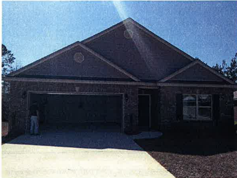
FRONT VIEW OF RESIDENCE. PICTURE TAKEN 3/15/2016

If using the Elevation Certificate to obtain NFIP flood insurance, affix at least 2 building photographs below according to the instructions for Item A6. Identify all photographs with date taken; "Front View" and "Rear View"; and, if required, "Right Side View" and "Left Side View." When applicable, photographs must show the foundation with representative examples of the flood openings or vents, as indicated in Section A8. If submitting more photographs than will fit on this page, use the Continuation Page.