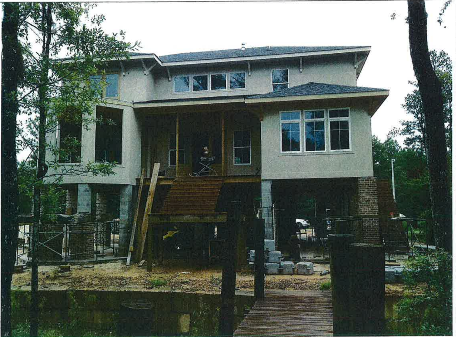
Rear View Facing North 6-4-15

If submitting more photographs than will fit on the preceding page, affix the additional photographs below. Identify all photographs with: date taken; "Front View" and "Rear View"; and, if required, "Right Side View" and "Left Side View." When applicable, photographs must show the foundation with representative examples of the flood openings or vents, as indicated in Section A8.