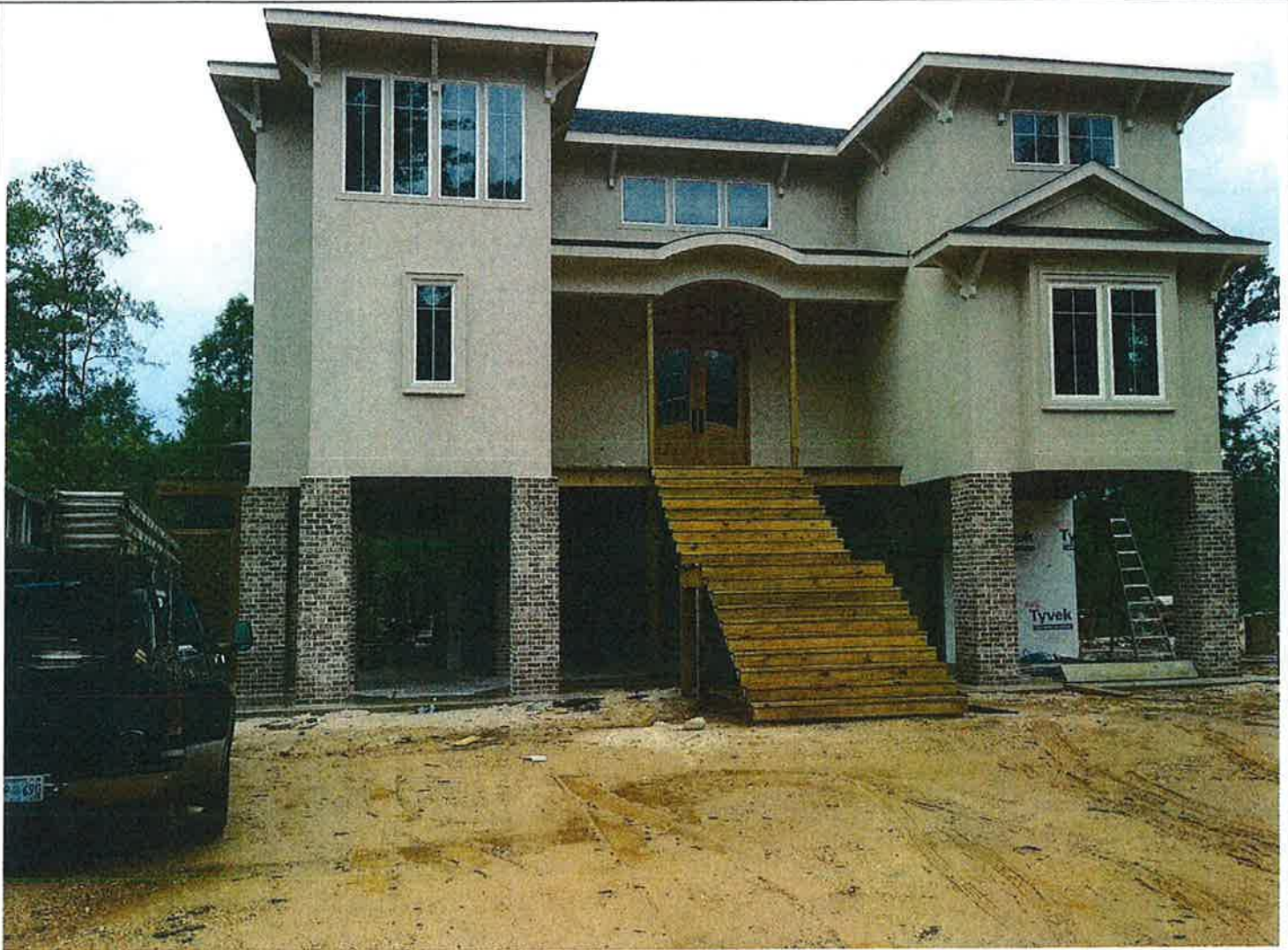
Front View Facing South 6-4-15

If using the Elevation Certificate to obtain NFIP flood insurance, affix at least 2 building photographs below according to the instructions for Item A6. Identify all photographs with date taken; "Front View" and "Rear View"; and, if required, "Right Side View" and "Left Side View." When applicable, photographs must show the foundation with representative examples of the flood openings or vents, as indicated in Section A8. If submitting more photographs than will fit on this page, use the Continuation Page.