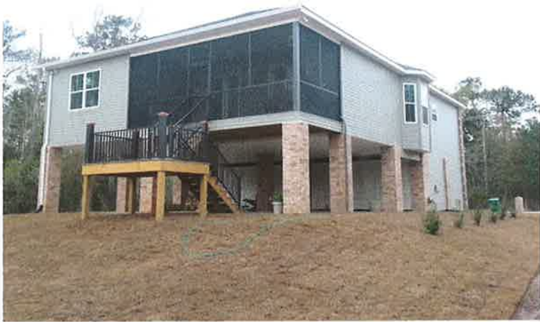
Southeast of the house looking at the Southern and Eastern edges.