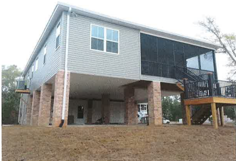
Southwest of the house looking North at the Southern and Western edges.