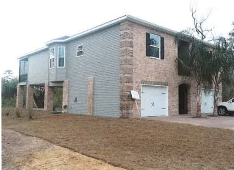
Northeast of the house looking Southwest at the Northern and Eastern edges.