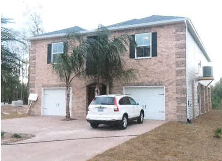
Northwest of the house looking Southeast at the Northern and Western edges.