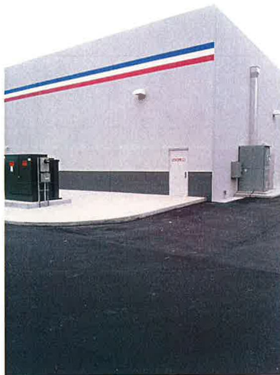
Corner view with mechanical

If submitting more photographs than will fit on the preceding page, affix the additional photographs below. Identify all photographs with: date taken; "Front View" and "Rear View"; and, if required, "Right Side View" and "Left Side View." When applicable, photographs must show the foundation with representative examples of the flood openings or vents, as indicated in Section A8.