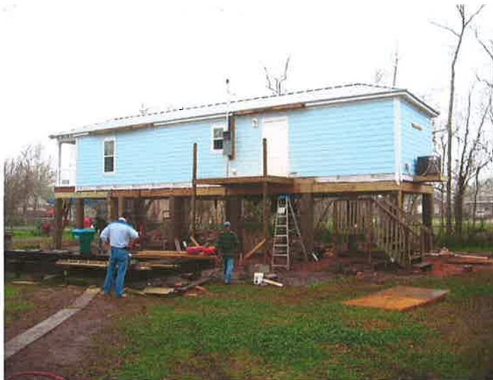
East Side of residence at 10075 Fountain Ave., 2/11/13