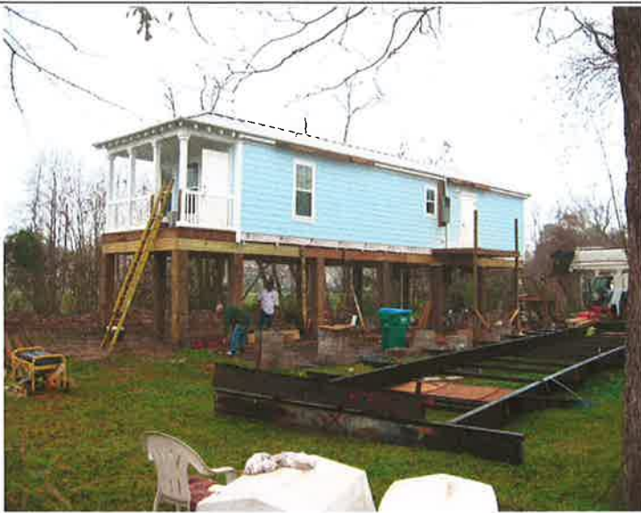
East Side of residence at 10075 Fountain Ave., 2/11/13

If using the Elevation Certificate to obtain NFIP flood insurance, affix at least 2 building photographs below according to the instructions for Item A6. Identify all photographs with date taken; "Front View" and "Rear View"; and, if required, "Right Side View" and "Left Side View." When applicable, photographs must show the foundation with representative examples of the flood openings or vents, as indicated in Section A8. If submitting more photographs than will fit on this page, use the Continuation Page.