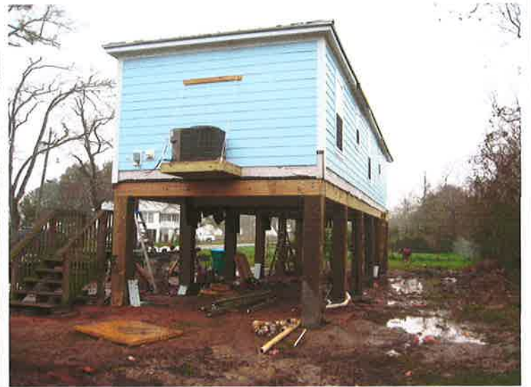
North end of residence at 10075 Fountain Ave., 2/11/13