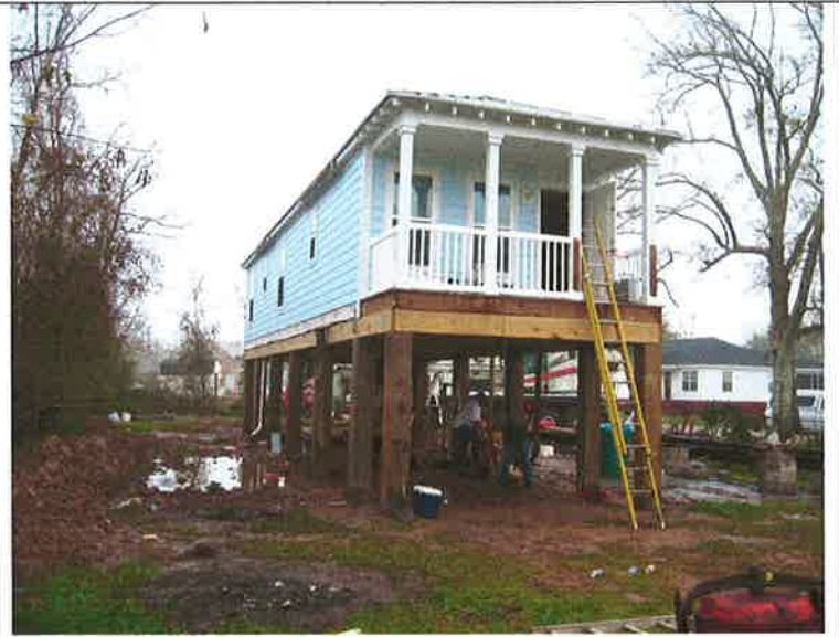
South end of residence at 10075 Fountain Ave., 2/11/13