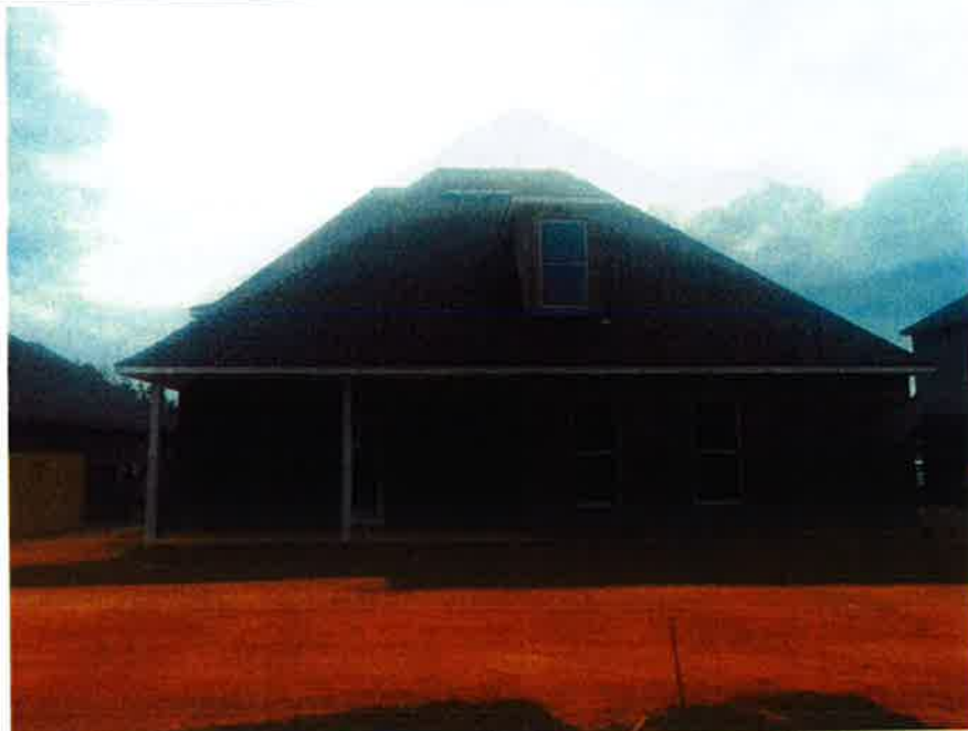
Photo Two Caption REAR VIEW OF RESIDENCE. THE PICTURE WAS TAKEN ON 3/25/2019.