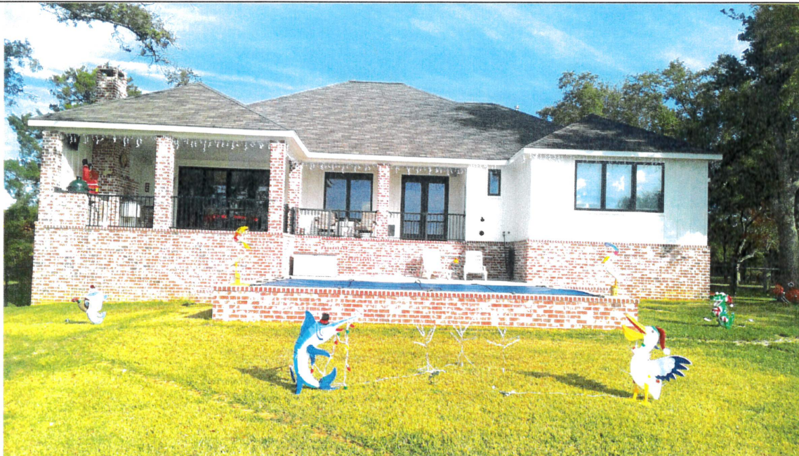
Photo Two Caption: REAR VIEW OF RESIDENCE. THE PICTURE WAS TAKEN ON 12/07/2023.