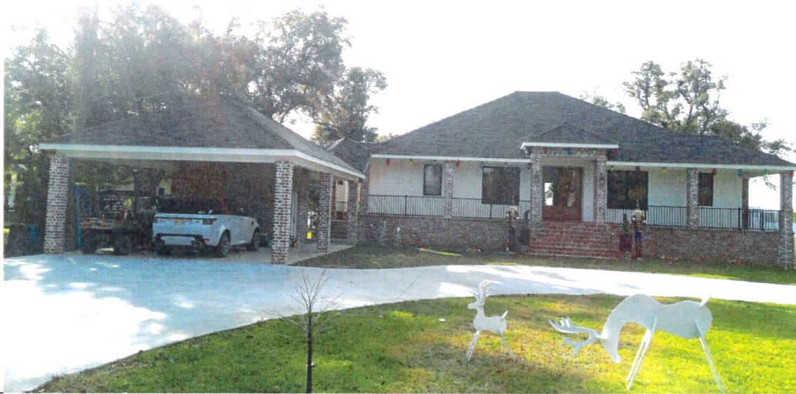
Photo One Caption: FRONT VIEW OF RESIDENCE. THE PICTURE WAS TAKEN ON 12/07/2023.

Instructions: Insert below at least two and when possible four photographs showing each side of the building (for example, may only be able to take front and back pictures of townhouses/rowhouses). Identify all photographs with the date taken and "Front View," "Rear View," "Right Side View," or "Left Side View." Photographs must show the foundation. When flood openings are present, include at least one close-up photograph of representative flood openings or vents, as indicated in Sections A8 and A9.