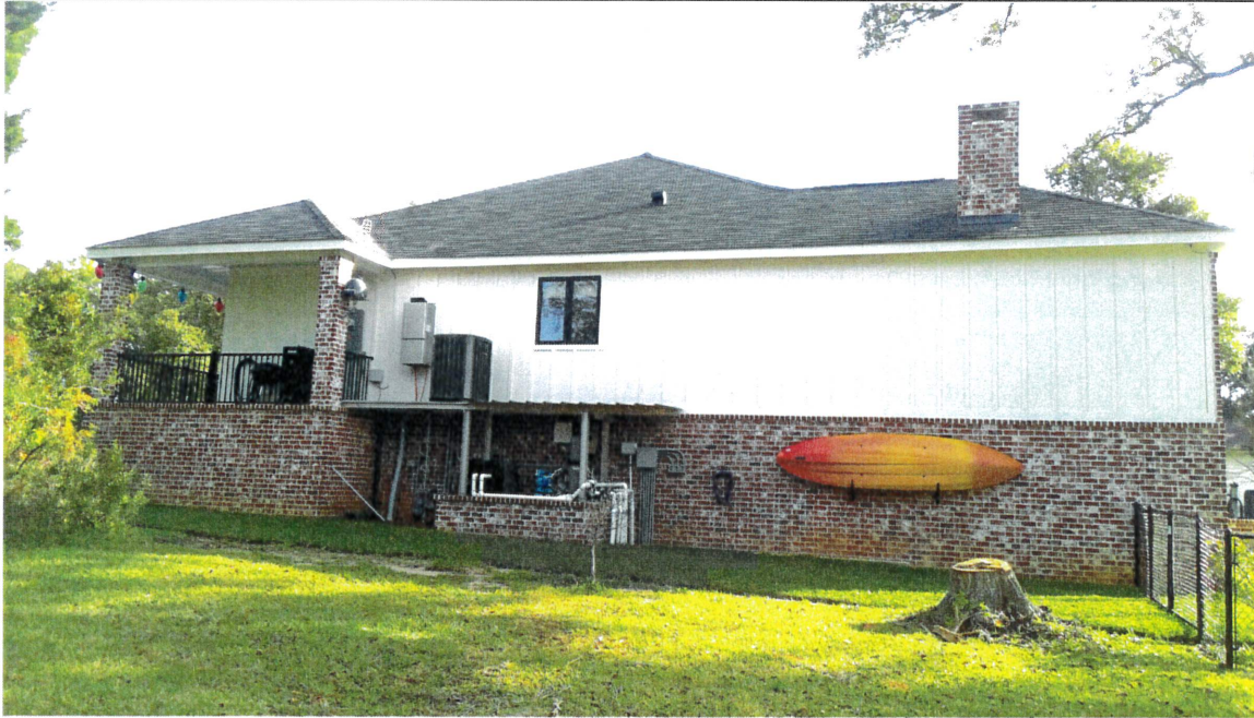
Photo Three Caption: RIGHT SIDE VIEW OF RESIDENCE. THE PICTURE WAS TAKEN ON 12/07/2023.

Insert the third and fourth photographs below. Identify all photographs with the date taken and "Front View," "Rear View," "Right Side View," or "Left Side View." When flood openings are present, include at least one close-up photograph of representative flood openings or vents, as indicated in Sections A8 and A9.