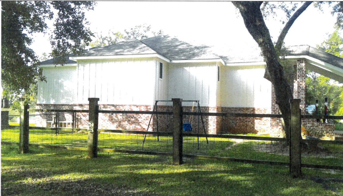
Photo Four Caption: LEFT SIDE VIEW OF RESIDENCE. THE PICTURE WAS TAKEN ON 12/07/2023.