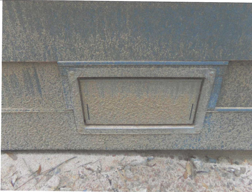
Photo Four Caption: TYPICAL VENT SMART VENT 1540-520 RATED FOR 200 SQ.FT