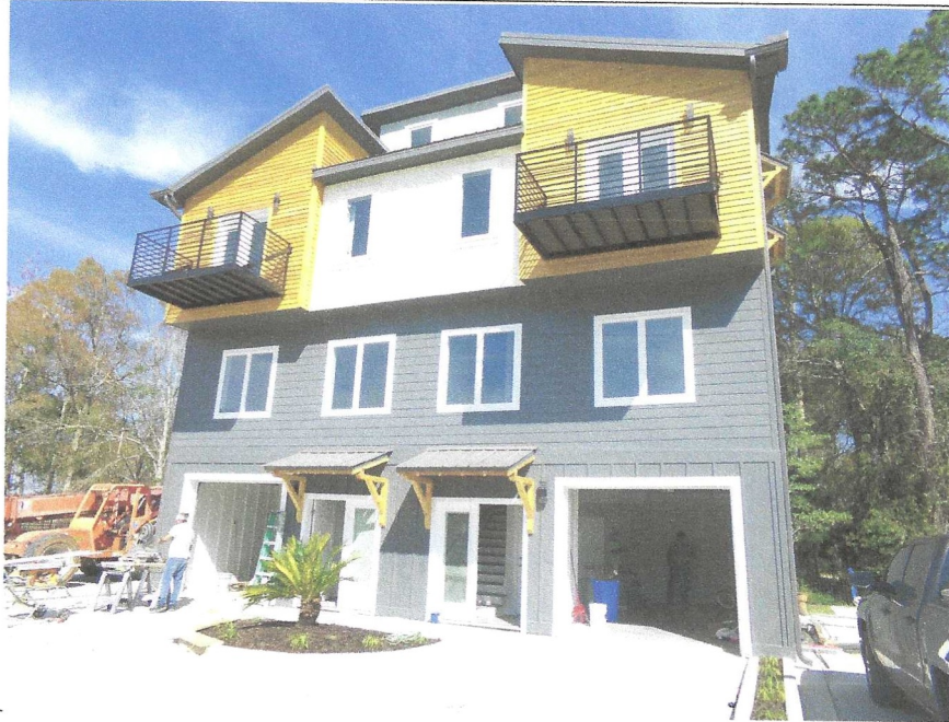
Photo One Caption: FRONT VIEW OF RESIDENCE. THE PICTURE WAS TAKEN ON 08/29/2023.

Instructions: Insert below at least two and when possible four photographs showing each side of the building (for example, may only be able to take front and back pictures of townhouses/rowhouses). Identify all photographs with the date taken and "Front View," "Rear View," "Right Side View," or "Left Side View." Photographs must show the foundation. When flood openings are present, include at least one close-up photograph of representative flood openings or vents, as indicated in Sections A8 and A9.