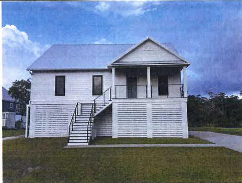
Photo One Caption: FRONT VIEW OF RESIDENCE. THE PICTURE WAS TAKEN ON 7/25/2025.

Instructions: Insert below at least two and when possible four photographs showing each side of the building (for example, may only be able to take front and back pictures of townhouses/rowhouses). Identify all photographs with the date taken and "Front View," "Rear View," "Right Side View," or "Left Side View." Photographs must show the foundation. When flood openings are present, include at least one close-up photograph of representative flood openings or vents, as indicated in Sections A8 and A9.