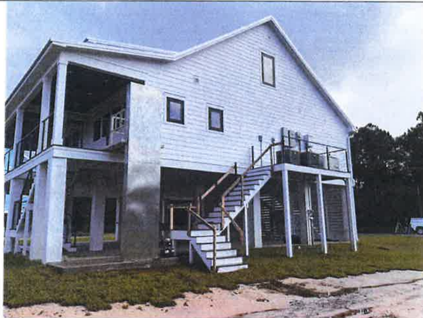
Photo Four Caption: LEFT SIDE VIEW OF RESIDENCE. THE PICTURE WAS TAKEN ON 7/25/2025.