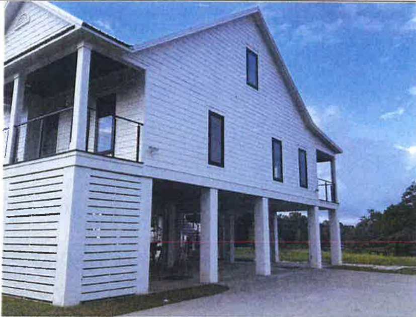
Photo Three Caption: RIGHT SIDE VIEW OF RESIDENCE. THE PICTURE WAS TAKEN ON 7/25/2025.

Insert the third and fourth photographs below. Identify all photographs with the date taken and "Front View," "Rear View," "Right Side View," or "Left Side View." When flood openings are present, include at least one close-up photograph of representative flood openings or vents, as indicated in Sections A8 and A9.