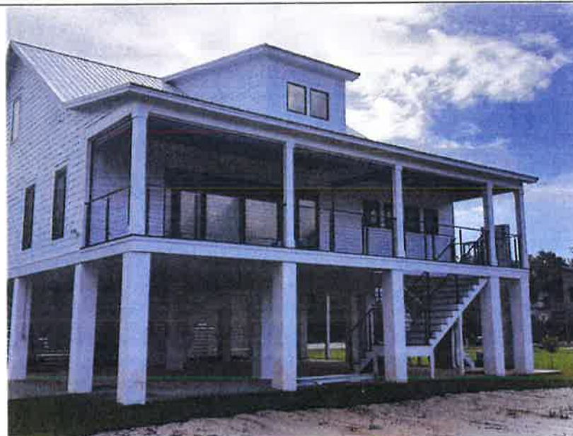
Photo Two Caption: REAR VIEW OF RESIDENCE. THE PICTURE WAS TAKEN ON 7/25/2025.