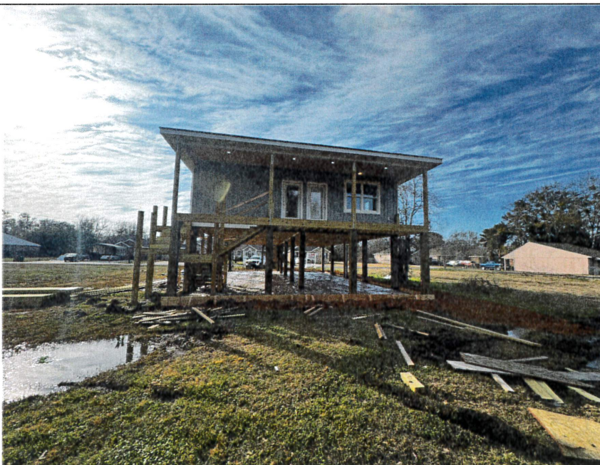
Photo Two Caption: REAR VIEW OF RESIDENCE. THE PICTURE WAS TAKEN ON 2/4/2026.