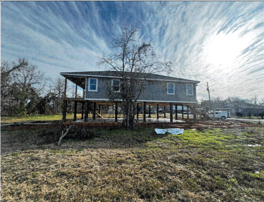
Photo Four Caption: LEFT SIDE VIEW OF RESIDENCE. THE PICTURE WAS TAKEN ON 2/4/2026.