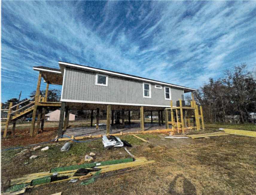
Photo Three Caption: RIGHT SIDE VIEW OF RESIDENCE. THE PICTURE WAS TAKEN ON 2/4/2026.

Insert the third and fourth photographs below. Identify all photographs with the date taken and "Front View," "Rear View," "Right Side View," or "Left Side View." When flood openings are present, include at least one close-up photograph of representative flood openings or vents, as indicated in Sections A8 and A9.