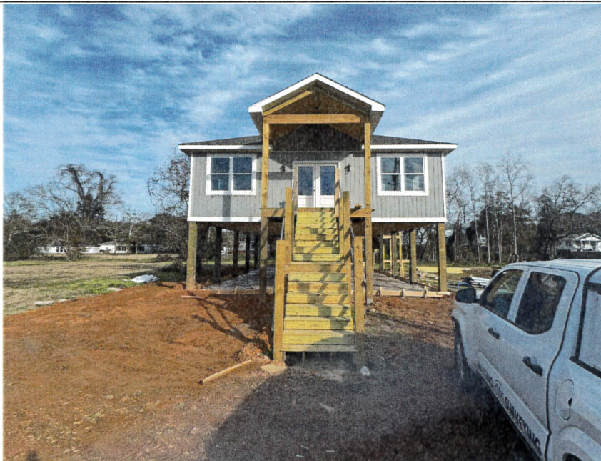
Photo One Caption: FRONT VIEW OF RESIDENCE. THE PICTURE WAS TAKEN ON 2/4/2026.

Instructions: Insert below at least two and when possible four photographs showing each side of the building (for example, may only be able to take front and back pictures of townhouses/rowhouses). Identify all photographs with the date taken and "Front View," "Rear View," "Right Side View," or "Left Side View." Photographs must show the foundation. When flood openings are present, include at least one close-up photograph of representative flood openings or vents, as indicated in Sections A8 and A9.